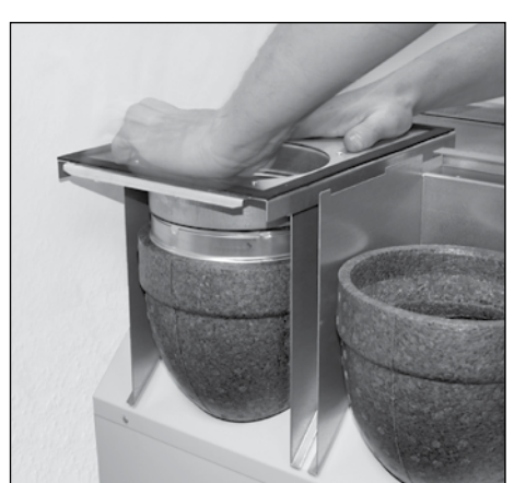
7. Mount end piece plate