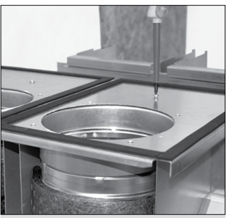
8. Secure two end piece plates with one screw each