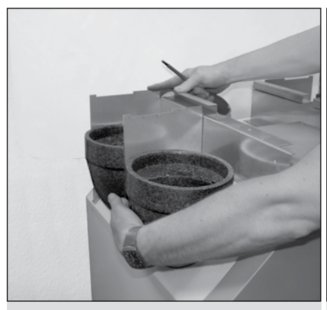
4. Attach the mountings to the U-profile