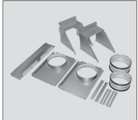
1. CW-K 320 installation set CA 350