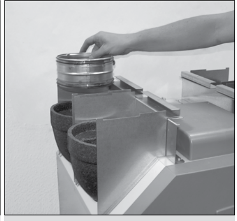
6. Insert the 160 mm nipple into the CA 350