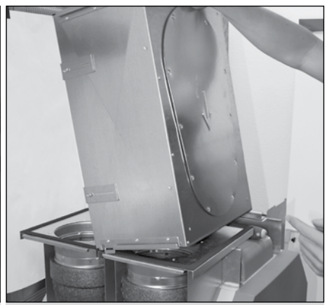
9. Place ComfoWell on the end plate