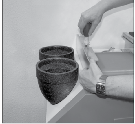
3. Locate U-profile and screw onto the CA 350